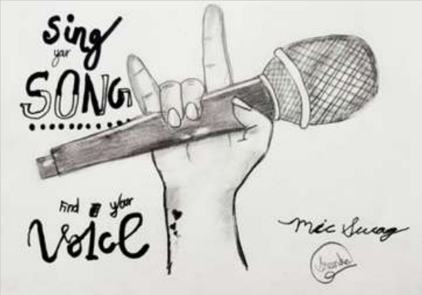
SREENIKA PALASH, VII A