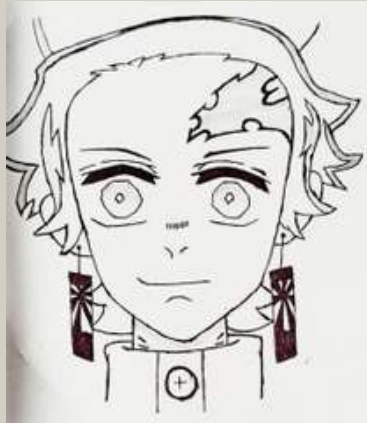
ANMOL PRASAD, VII A